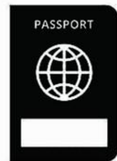
Travel documents Passport, Visa, SEVIS