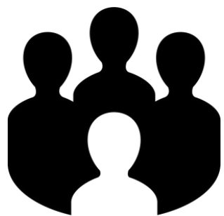
Trained Professionals Advisers