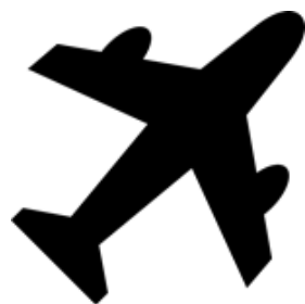
Transportation & Accommodation for tests All expenses covered