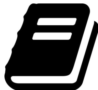
Prep Materials Hard Copies or Virtual