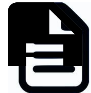
Translations of academic documents